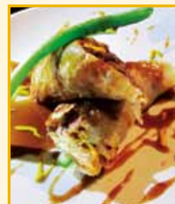
Peking Duck Wrap