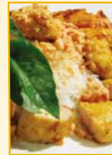
Saigon Noodle with Grilled Chicken