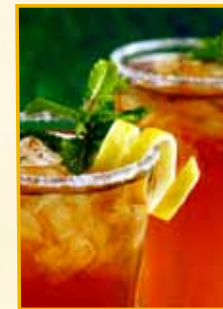
Thai Iced Tea